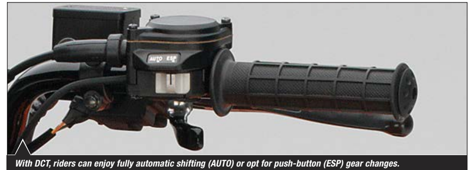
With DCT, riders can enjoy fully automatic shifting (AUTO) or opt for push-button (ESP) gear changes.