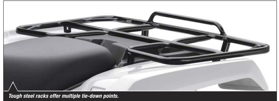
Tough steel racks offer multiple tie-down points.

Electric Power Steering (EPS) system enhances maneuverability and reduces kickback through the handlebar for improved all-around steering and comfort.