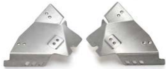
Front A-Arm Guards