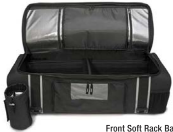
Front Soft Rack Bag