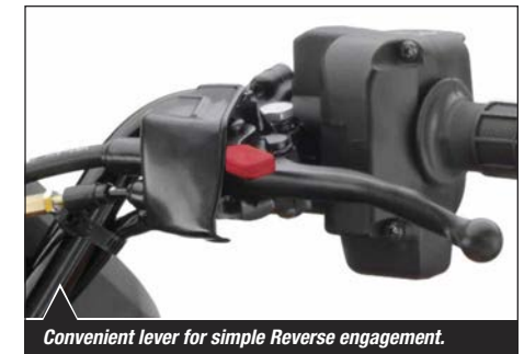
Convenient lever for simple Reverse engagement.