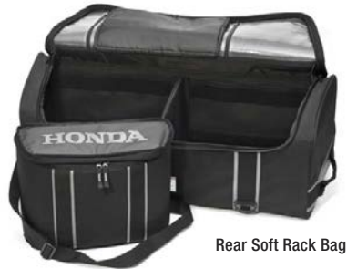
Rear Soft Rack Bag