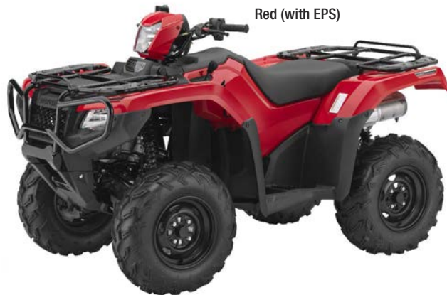
Red (with EPS)