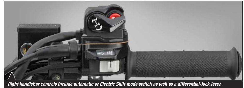
Right handlebar controls include automatic or Electric Shift mode switch as well as a differential-lock lever.