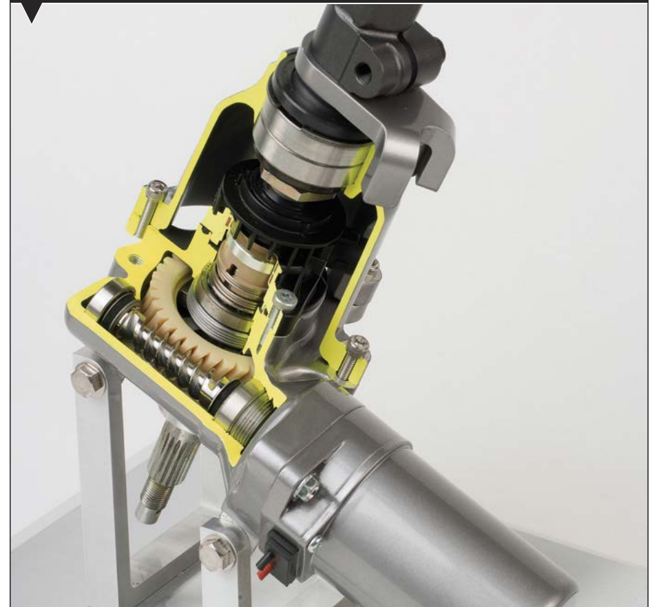
Electric Power Steering (EPS) system enhances maneuverability and reduces kickback through the handlebar for improved all-around steering and comfort.