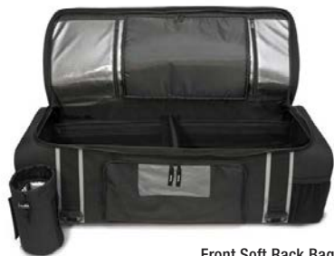
Front Soft Rack Bag