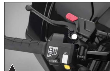
Convenient lever for simplified Reverse engagement.