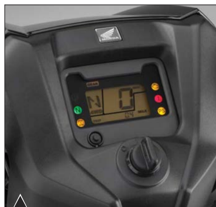
Multifunction LED meter includes a Maintenance Minder system that makes it easy for owners to remember service intervals.