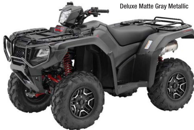
Deluxe Matte Gray Metallic