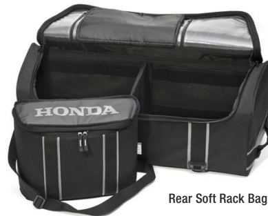
Rear Soft Rack Bag