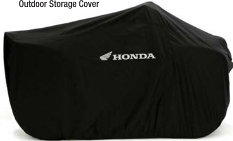
Outdoor Storage Cover

Soft Rack Bags (Front and Rear), Fender Bag, Outdoor Storage Cover, Heated Grips, Plow Blade, Plow Push Tube, Plow Mount Kit, Winch Kit, Winch Mount Kit, Recoil Starter, A-Arm Guards (Front and Rear), Rear Frame Skidplate, Rear Bumper, Frame Skidplate, Accessory Sub Harness, Aluminum Wheels (Front and Rear) [Wheels not applied to Deluxe Model] (some accessories not shown)