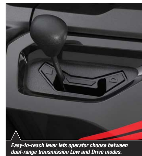
Easy-to-reach lever lets operator choose between dual-range transmission Low and Drive modes.