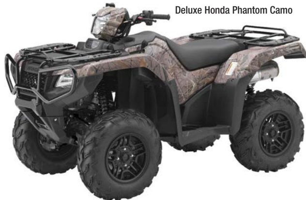
Deluxe Honda Phantom Camo