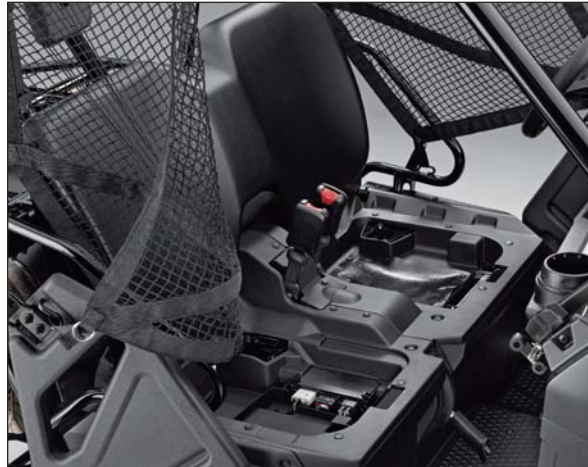
Seat removes without tools allowing for quick fluid checks and maintenance.