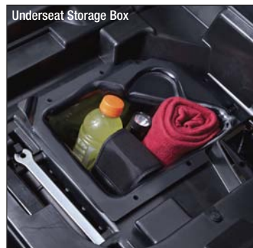
Underseat Storage Box