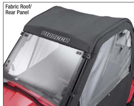
Fabric Roof/Rear Panel