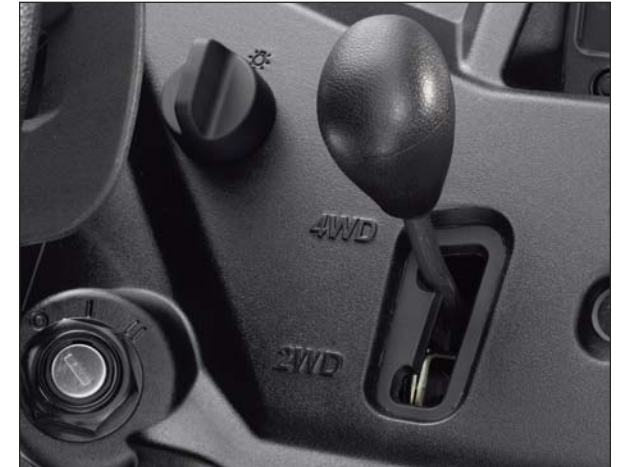
Gearshift selector makes it easy to switch from 2WD to 4WD.