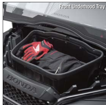
Front Underhood Tray