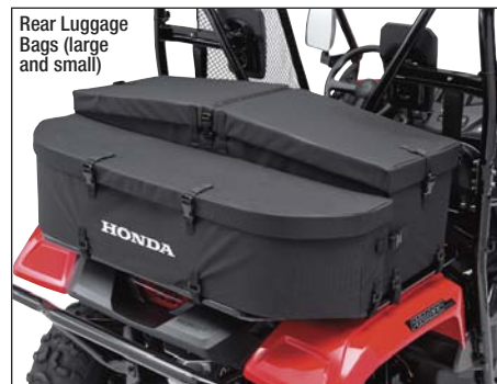
Rear Luggage Bags (large and small)