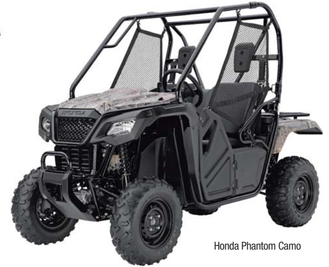
Honda Phantom Camo